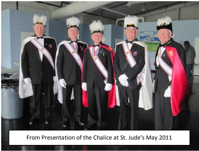
From Presentation of the Chalice at St. Jude's May 2011