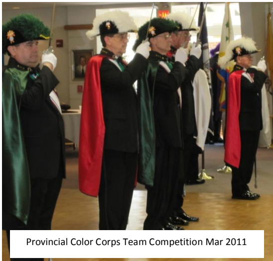
Provincial Color Corps Team Competition Mar 2011