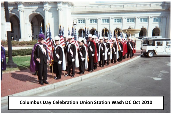
Columbus Day Celebration Union Station Wash DC Oct 2010