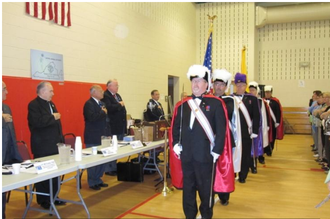
State Meeting Oct 2010