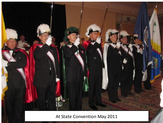
At State Convention May 2011