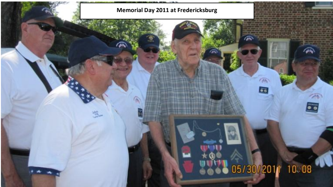
Memorial Day 2011 at Fredericksburg