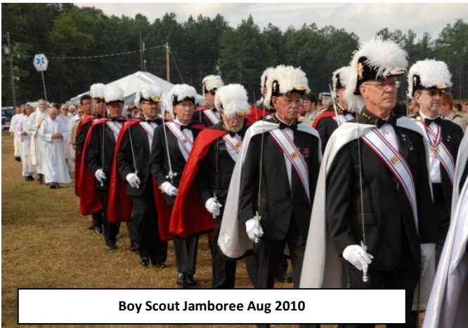
Boy Scout Jamboree Aug 2010