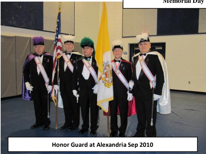
Honor Guard at Alexandria Sep 2010