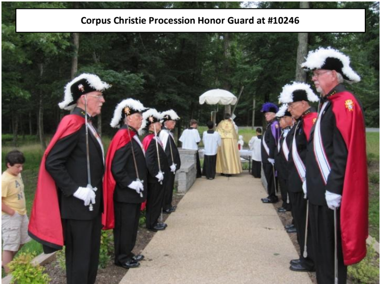
Corpus Christie Procession Honor Guard at #10246