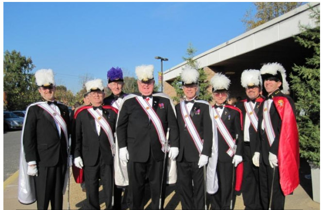
Honor Guard at St. Mary's Nov 2010