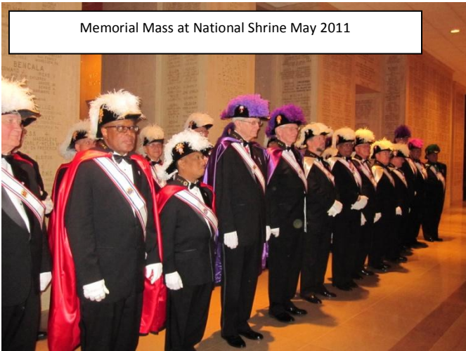
Memorial Mass at National Shrine May 2011