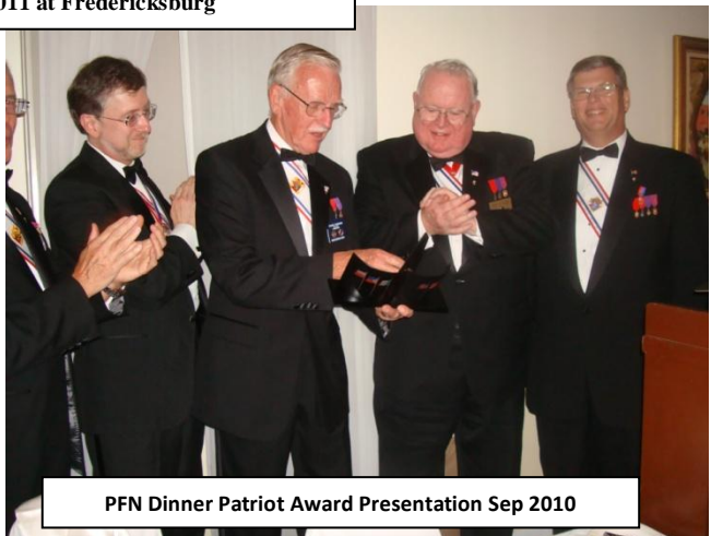
PFN Dinner Patriot Award Presentation Sep 2010