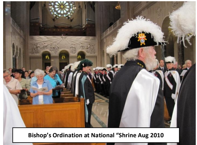
Bishop's Ordination at National "Shrine Aug 2010