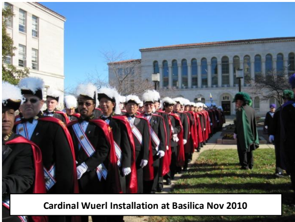
Cardinal Wuerl Installation at Basilica Nov 2010