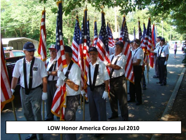
LOW Honor America Corps Jul 2010